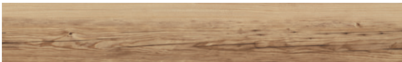
Castle Oak Art.-No. KSYB001