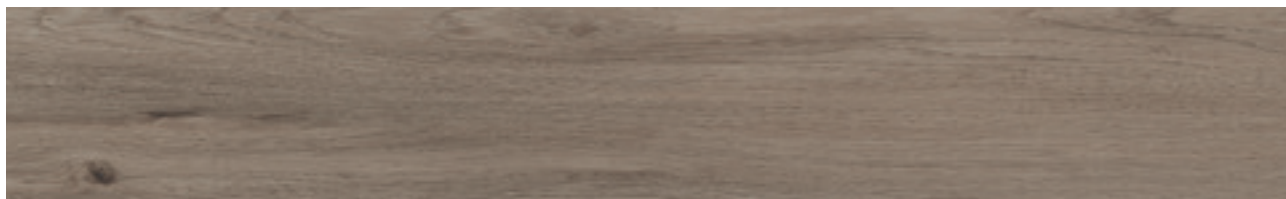
Ash Oak Art.-No. KSYM001