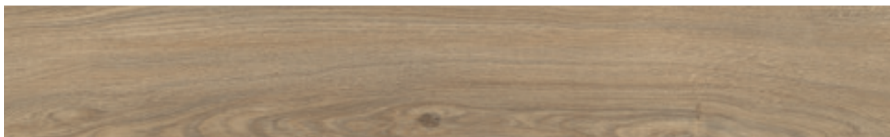
Land Oak Art.-No. KSYC001